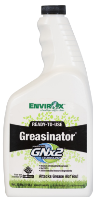
Also available in RTU!